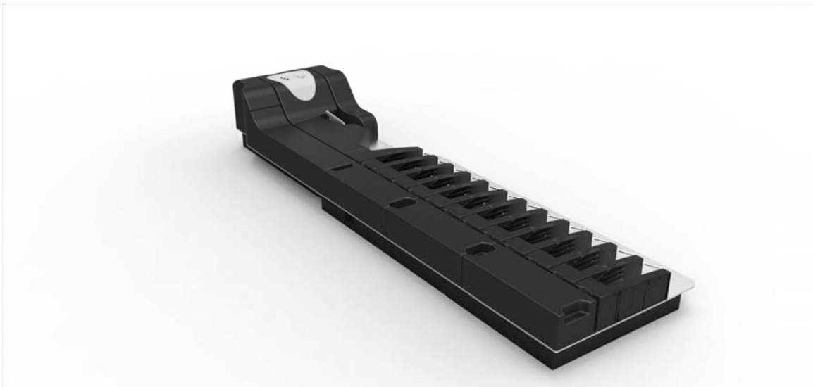
Figure 3 - Quantum DS – rear view