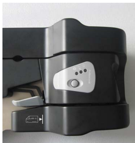
Figure 8 - LEDs and Stop/Start Button