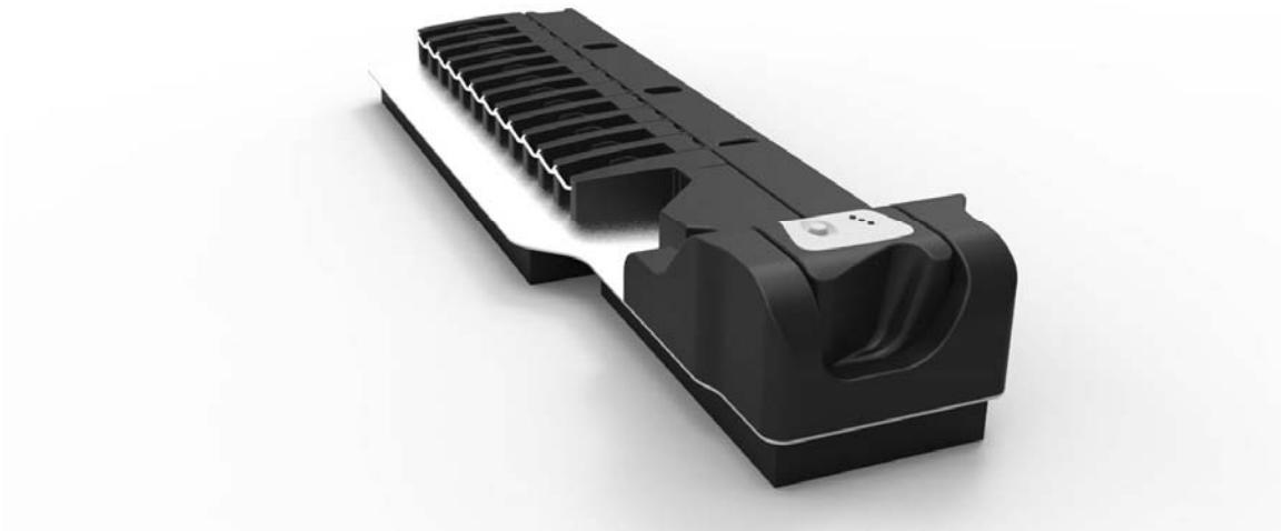
Figure 2 - Quantum DS - View from right side