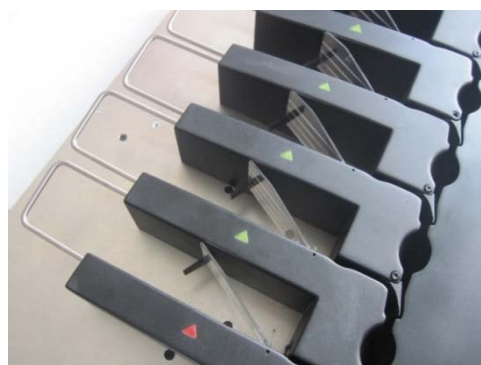
Figure 7 - Sort Pockets

The sort pocket configuration for the Quantum DS is 12 pockets. The pockets each hold up to 200 items and include pocket full sensors and indicators for easy operator identification and action.