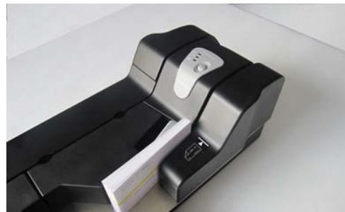
Figure 4 - Input Hopper

The input hopper of the Quantum DS can handle up to 300 (24 lb/90gsm) items. It was designed to allow additional items to be added to the input hopper while it is actively processing items. It also features the SmartSource Open Professional auto-open feature once the hopper is empty. This allows the operator to easily re-fill the hopper while in an idle state. Once items have been added and the sorter has received the command to begin processing, the input hopper is automatically closed. The feeder area also incorporates our industry proven, infra-red optical, two-position, double document detection hardware and software as a standard feature on the Quantum DS.