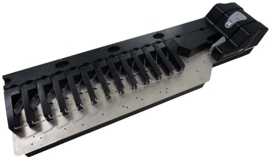
Figure 1 - Quantum DS

Digital Check is committed to providing cost effective check and item processing hardware and middleware to enable clients to perform their mission critical tasks in an efficient and cost effective manner. As part of that commitment, Digital Check is pleased to include in its portfolio of payment processing systems, the Quantum DS as the next generation multi-pocket reader-sorter, perfectly suited to meet low to medium volume processing requirements. At a rated speed of 200 (6-inch / 15.2 cm) documents per minute, it is an intelligent powerhouse that fits on a desktop at an affordable price.