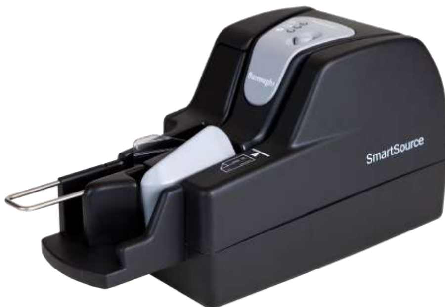
Figure 1–1. SmartSource Open Professional (Single-Pocket Model)

Based on the latest technology for distributed capture devices and over five decades of company experience, SmartSource devices have a compact and ergonomic design with full-featured document processing and “state-of-the art” image processing and security capabilities. A SmartSource Open Professional device is shown in Figure 1–1.