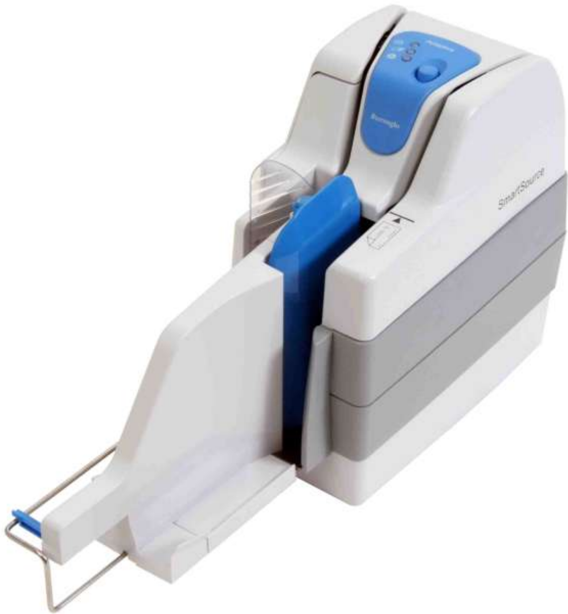
Figure 2-1. SmartSource Adaptive