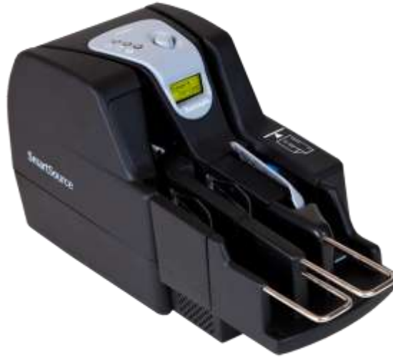
Figure 3–1. SmartSource Open Expert (Two-Pocket Model)

Embedded computing for nearly all platform functions differentiates the SmartSource Expert from the SmartSource Professional and Adaptive. The embedded computing architecture transforms a SmartSource Expert device into an “intelligent” device. The addition of a network interface enables the SmartSource Expert device to perform as a network appliance that can operate in a true thin-client environment. As a network appliance, a SmartSource Expert device offers an additional user interface (backlit LCD display) to communicate operational status and/or exception conditions directly to the operator.