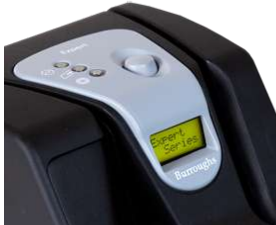
Figure 3–2. SmartSource Open Expert Operator Interface

In addition to the three (3) LED status indicators and a feeder start/stop button – supporting the one-touch “Smart-clear” function, the SmartSource Expert device also provides a multi-line back-lit LCD display (see Figure 3–2) that is programmatically controlled to display operator and application messages.