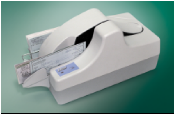
The intelligent autofeeder is a key feature of the TellerScan 300.

For Large Financial Institutions Worldwide