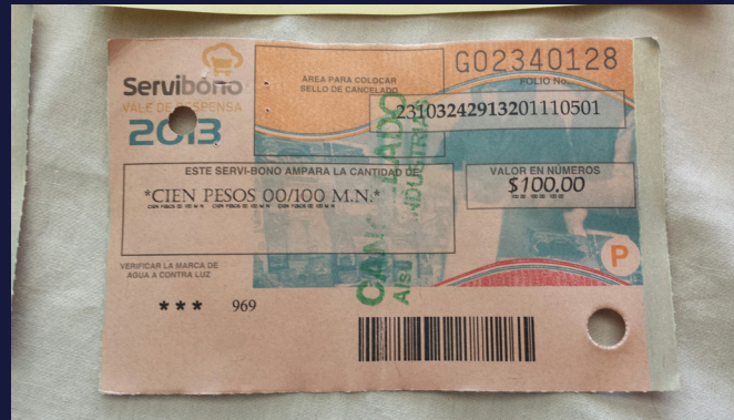
This transit ticket from Mexico is an example of a coarse document that can be harder on scanners than your typical check.