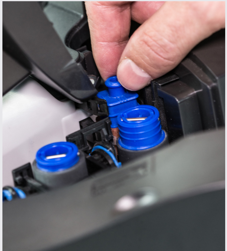
The discriminator roller – the part being picked up by the hand in the image above – ensures that only one check at a time can enter the scanner's feed path. A dirty or worn discriminator roller is one of the most common causes of misfeeds, double-feeds, and other related errors while scanning.

For that reason, the best way to clean a scanner has always been to hold a cleaning card in place at the start of the track for several seconds before letting it run through, thereby letting it scrub the buildup from the places that need it most. Unfortunately, very few operators know to do that, so they just run the card through the track like a regular check. In the very early days, there actually wasn't even a good way to do this; the cleaning card had to be run through with the user's active deposit program, which would often